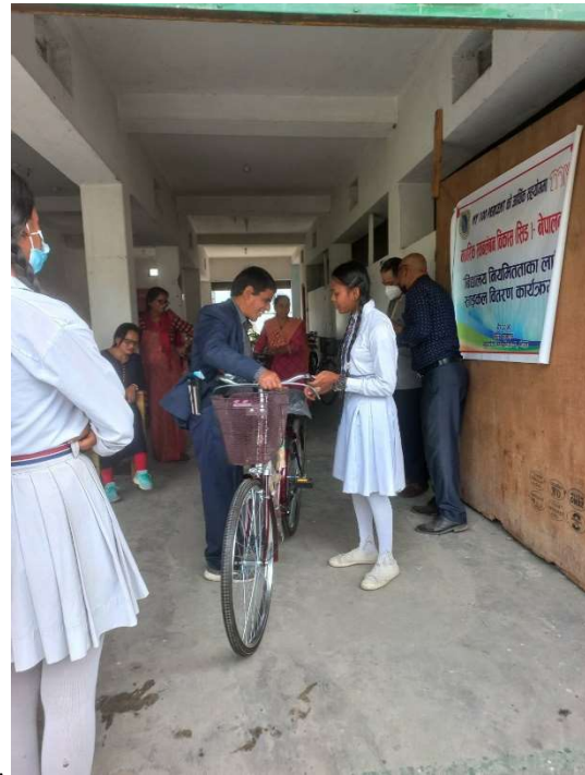
A grade 10 student and teacher work through the mechanics of the new set of wheels.

Our newest program is the Bicycle Loan Program. My 100 Percent purchased 187 bicycles and have loaned the bikes to at-risk students in various schools within Sundar Haraicha municipality in cooperation with the local schools and council. Bike loan programs in other developing countries have proven to be very successful in increasing student attendance at upper elementary and high school levels. The loan program encourages responsibility and independence.